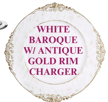
WHITE BAROQUE W/ ANTIQUE GOLD RIM CHARGER