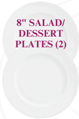
8" SALAD/ DESSERT PLATES (2)