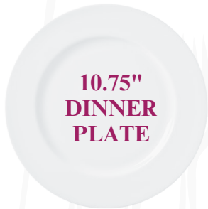
10.75" DINNER PLATE