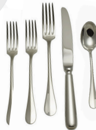
DINNER FORK & KNIFE, TEASPOON, SALAD/DESSERT FORKS (2)