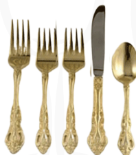
DINNER FORK & KNIFE, TEASPOON, SALAD/DESSERT FORKS (2)