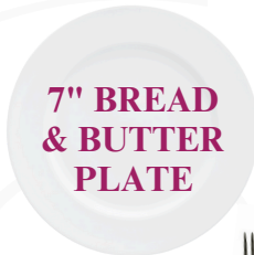
7" BREAD & BUTTER PLATE