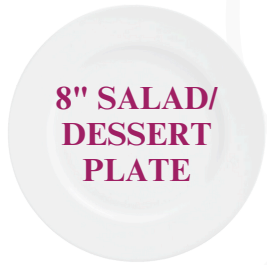
8" SALAD/ DESSERT PLATE