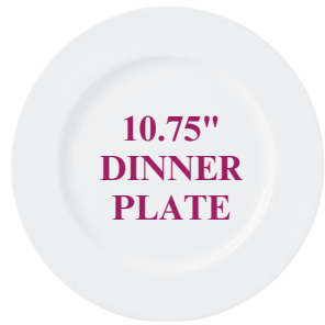
10.75" DINNER PLATE