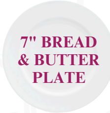
7" BREAD & BUTTER PLATE