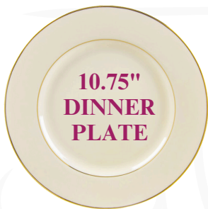
10.75" DINNER PLATE