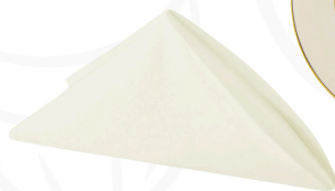
IVORY LAMOUR NAPKIN