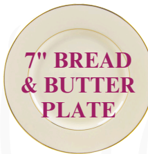
7" BREAD & BUTTER PLATE