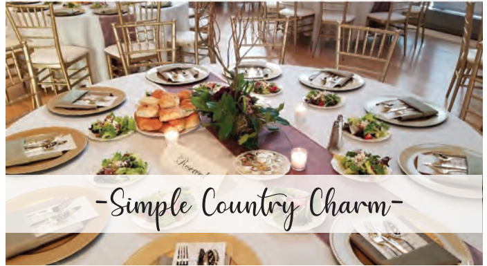
-Simple Country Charm-

Crisp Artisan Salad with Heirloom Tomatoes, Blood Oranges, Radishes & Asiago Croutons with balsamic vinaigrette Chicken Florentine Garlic Red Skin Mashed Potatoes Grilled Vegetables Chef Crafted Pasta Bar: Cavatappi pasta with assorted Sauces - Marinara, Parmesan Cream Sauce, Tomato Vodka Cream or Fresh Basil Pesto $29/person