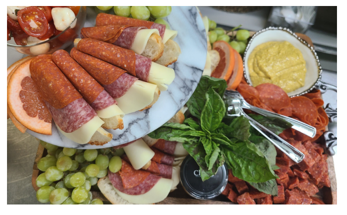
All Grand Displays require a minimum of 15 guests Assembled on disposable trays for unstaffed events All staffed events will be prepared on commercial serving pieces at no additional cost

ANTIPASTI $15 pp An overflowing decorative masterpiece filled with Italian inspired artisan ingredients. An abundance of cured meats, hard and soft cheeses, crusty breads, olives, marinated mushrooms, pickled vegetables, tomato basil bruschetta, roasted tomatoes, spinach artichoke dip and honey mustard. Garnished with cherry tomatoes, pepperoncinis, and savory prosciutto-wrapped salt sticks.